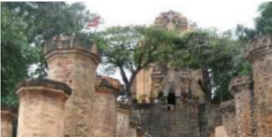
The Po Nagar Cham