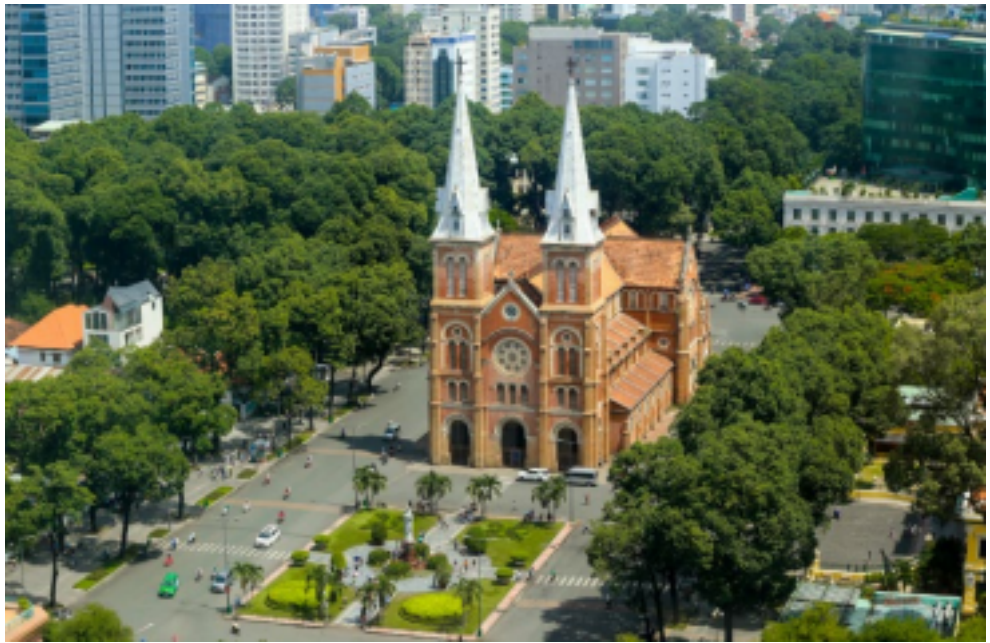
Notre Dame Cathedral Basilica, Ho Chi Minh City