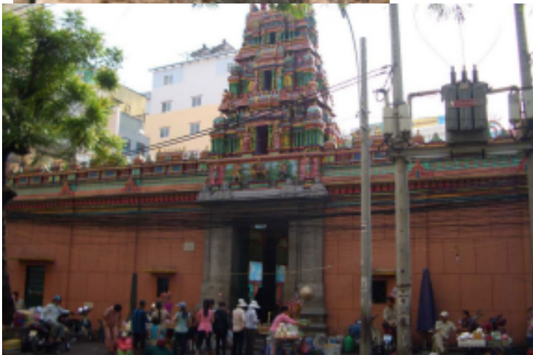
Subramaniam Temple, HCMC