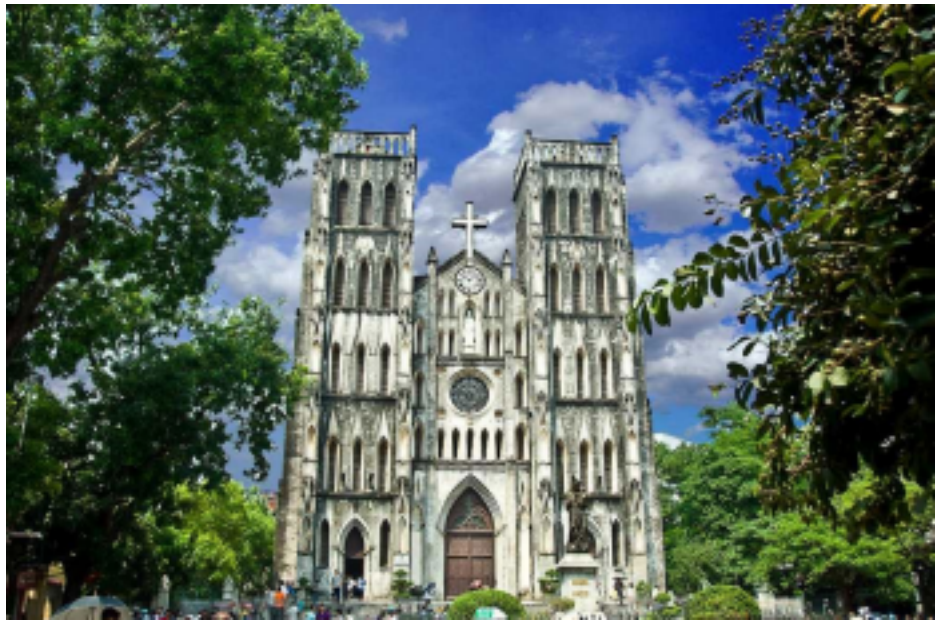
St. Joseph's Cathedral, Hanoi